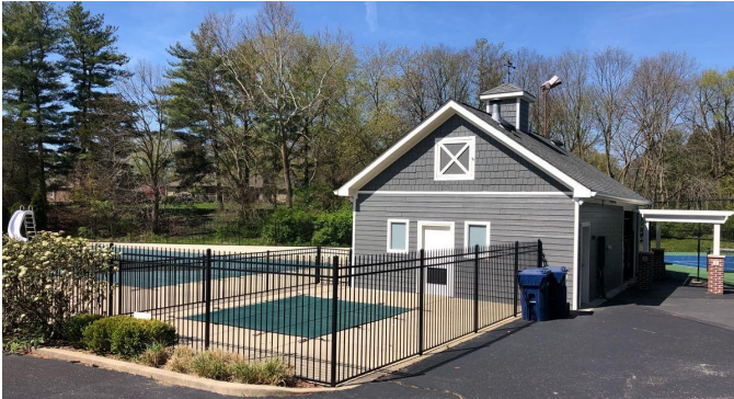
The newly painted clubhouse